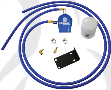
Coolant Filtration Kit