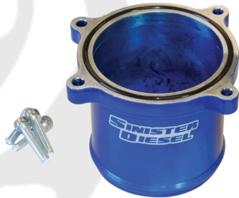
Throttle Valve Delete