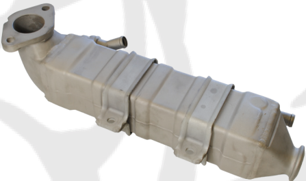
Sinister Diesel EGR Cooler