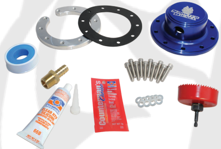
Fuel Tank Sump